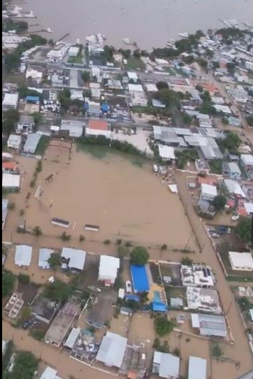
Hurricane Fiona, 2022