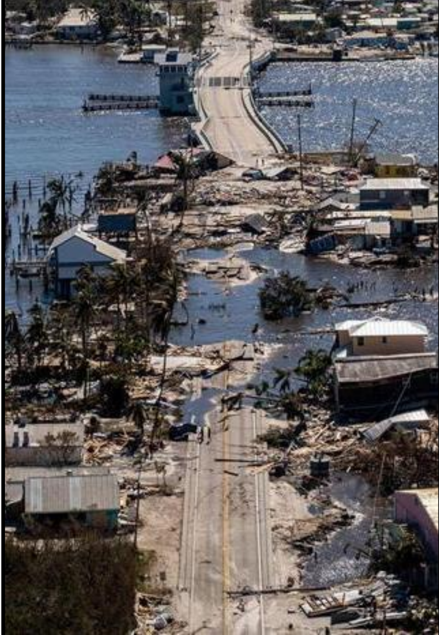
Hurricane Ian, 2022