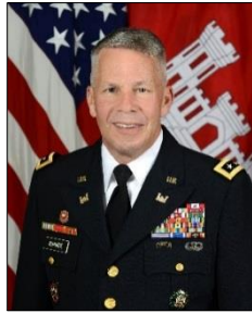
LTG Todd Semonite, PE Chief of Engineers and CG USACE